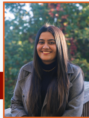
Shafaq Khan Policy